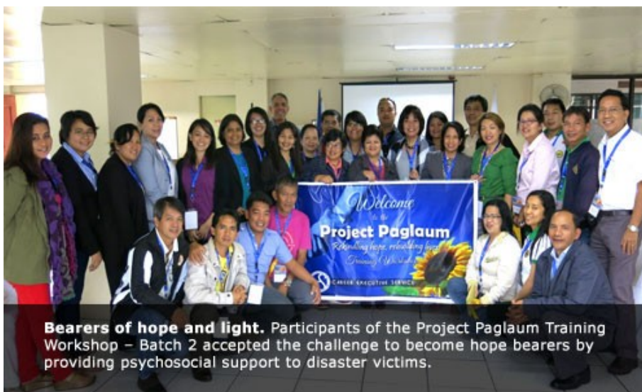
Bearers of hope and light. Participants of the Project Paglaum Training Workshop – Batch 2 accepted the challenge to become hope bearers by providing psychosocial support to disaster victims.

The program was comprised of various lectures on basic principles and skills on psychosocial support in disaster situations; effects of disaster on children, adults and family; and gender, cultural and spiritual sensitivity in disaster mental health work; self care; and psychological first aid. The second batch of hope bearers also engaged in different psychosocial processing activities including art, music and dance sessions, simulation and debriefing dialogues. Furthermore, they gathered as one during the homily/ ecumenical service themed